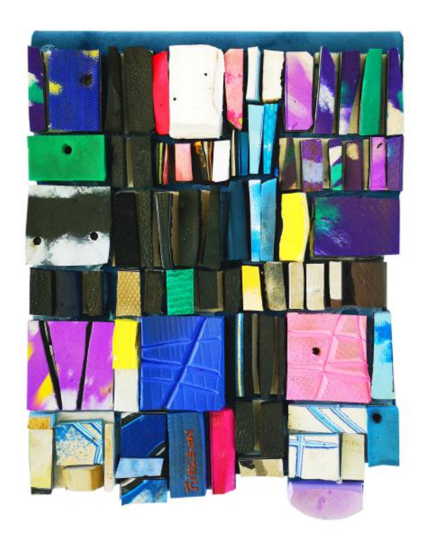
Bolga (Name of a Place) 3 Found Flip-flops on Suede 30.5cm x 40cm 2020