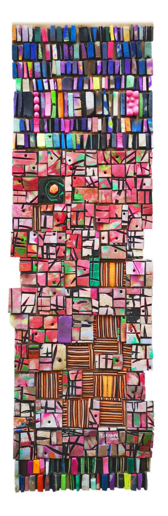
Kom ye ya (hunger is painful) Found Flip-flops on Suede 40cm x 131cm 2020