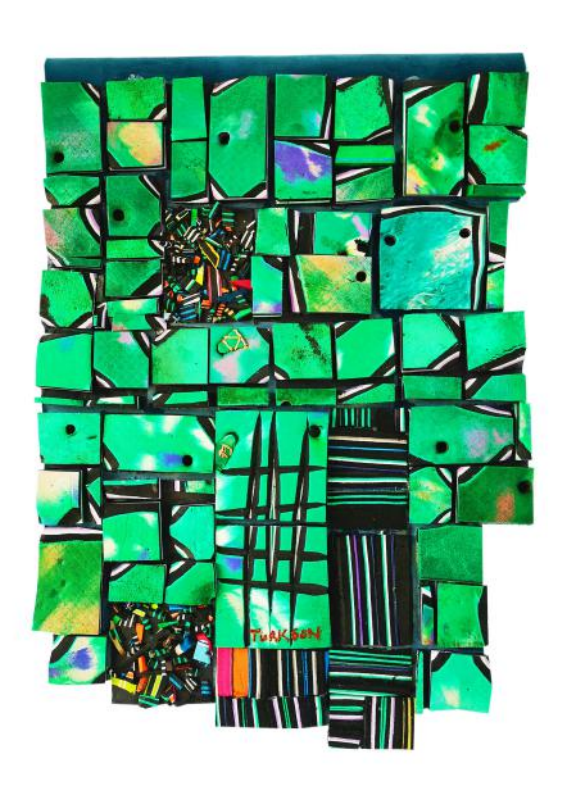
Sisala (Name of a People) 3 Found Flip-flops on Suede 30cm x 44cm 2020