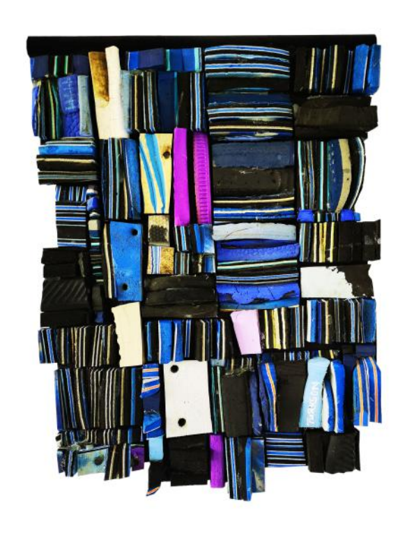
Grusi (Name of a People) 3 Found Flip-flops on Suede 30.5cm x 40cm 2020