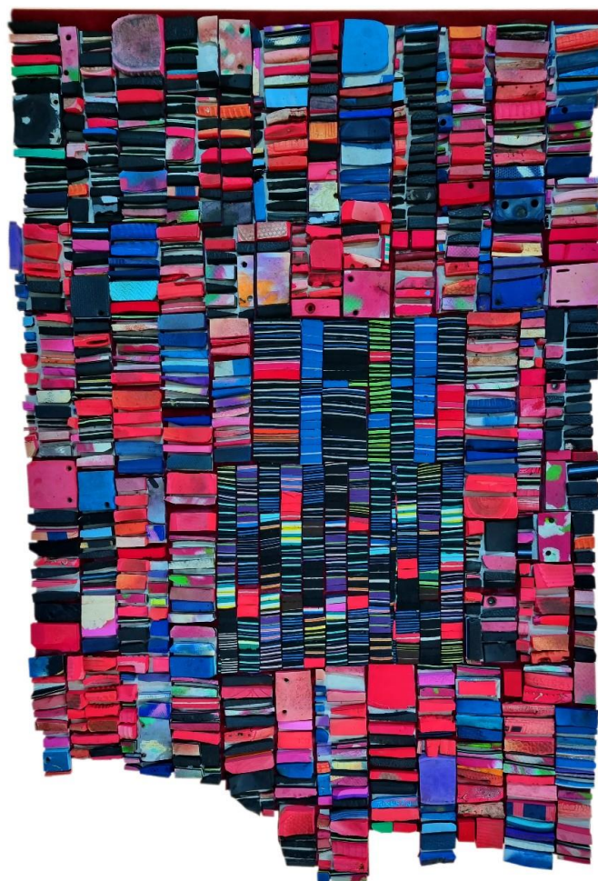
Patrick Tagoe-Turkson ᏊᏉᏉᏉᏉ (Red Woman) Found flip-flops on suede 81cm x 123cm 2021 £4200