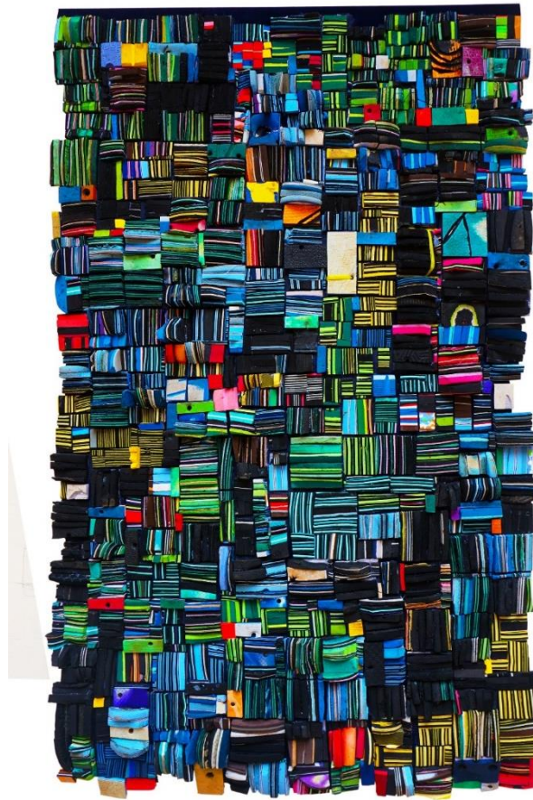
Patrick Tagoe-Turkson Adwin Pa (Good Thoughts) Found flip-flops and Yarns on suede 60cm x 102cm 2018 £3,500