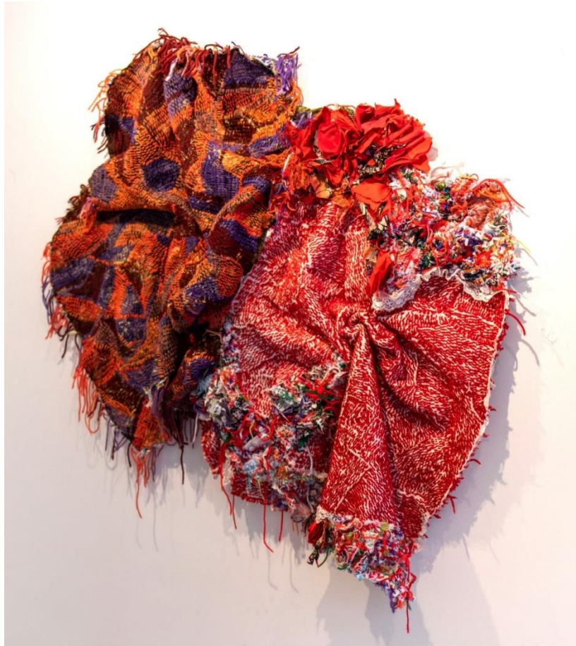
Georgina Maxim Two hearts in one Mixed media, textile 88cm x 65cm approx 2022 £6800