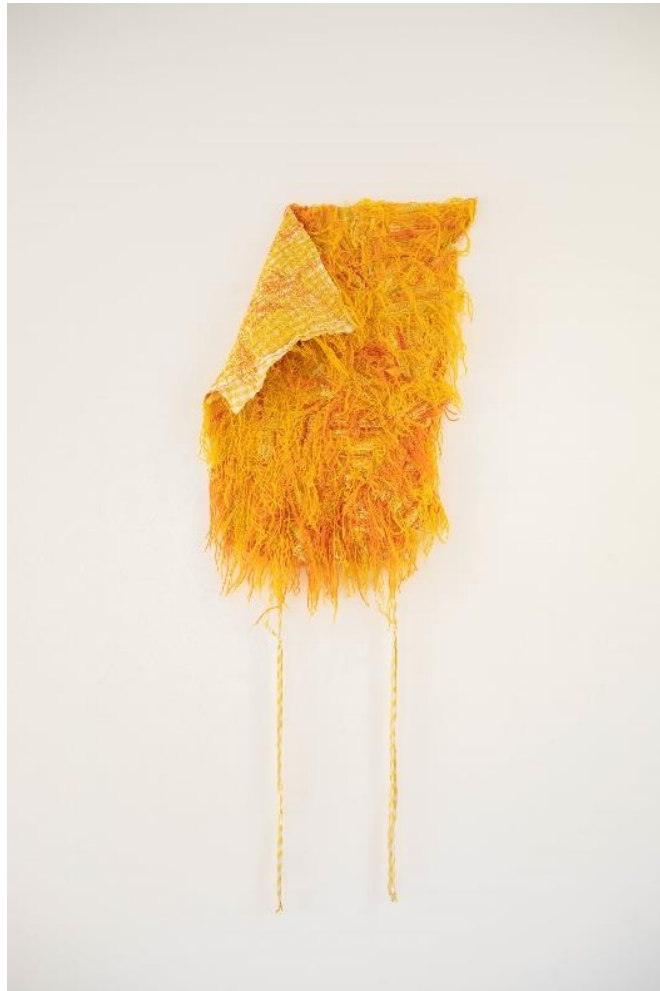
Georgina Maxim Returned the sentiment Mixed media, textile 117cm x 43cm 2021 £1500