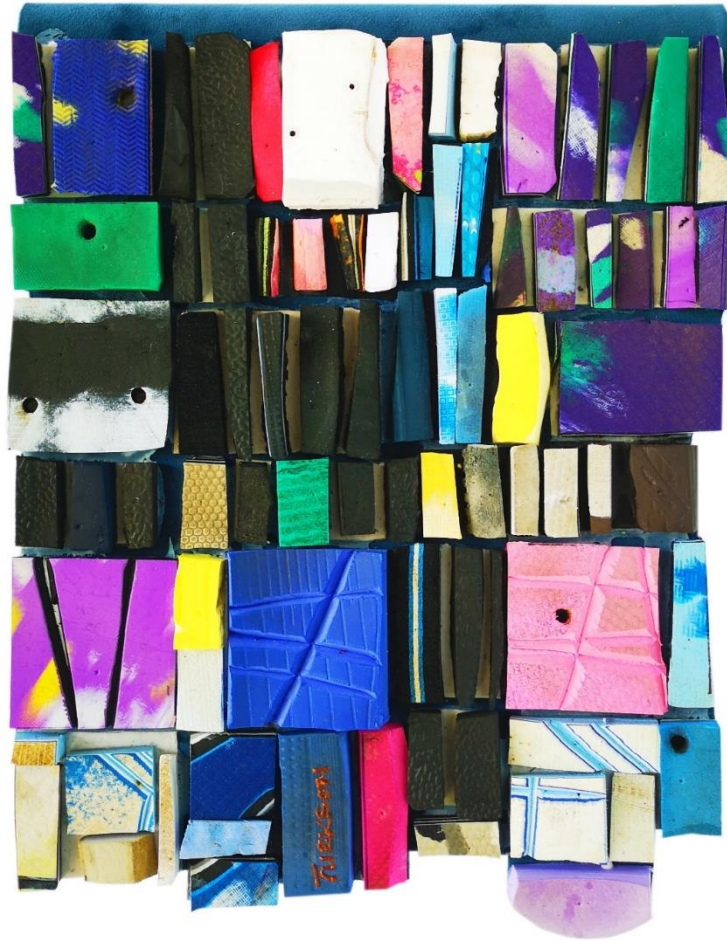
Patrick Tagoe-Turkson Bolga (Name of a Place) 3 Found Flip-flops on Suede 30.5cm x 40cm 2020 £500